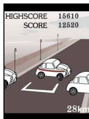
La Car Jenne 2