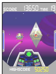
The Space Defense Forces

Featuring 3D graphics and sound, simple one-button play and the option to log high scores online*, CELL's mini games are considered some of the most popular in Japan. Additionally, most of CELL games are less than 100K in file size, making them fast and easy to download. Many CELL games garner up to 1,000,000 downloads their first day of availability.